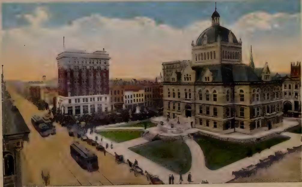
FAYETTE COUNTY COURT HOUSE, LEXINGTON, KY.